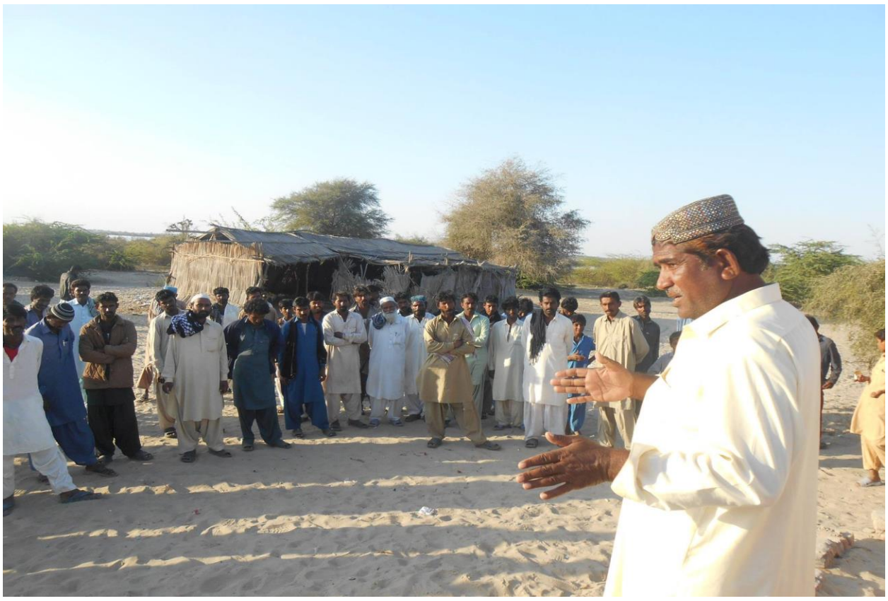
two major phases as mentioned hereunder;

In continuation with the PFF's yearly campaign for the restoration for River Indus and Indus Delta, the PFF organized Sindh Peoples Caravan . The Sindh Peoples Caravan was divided into