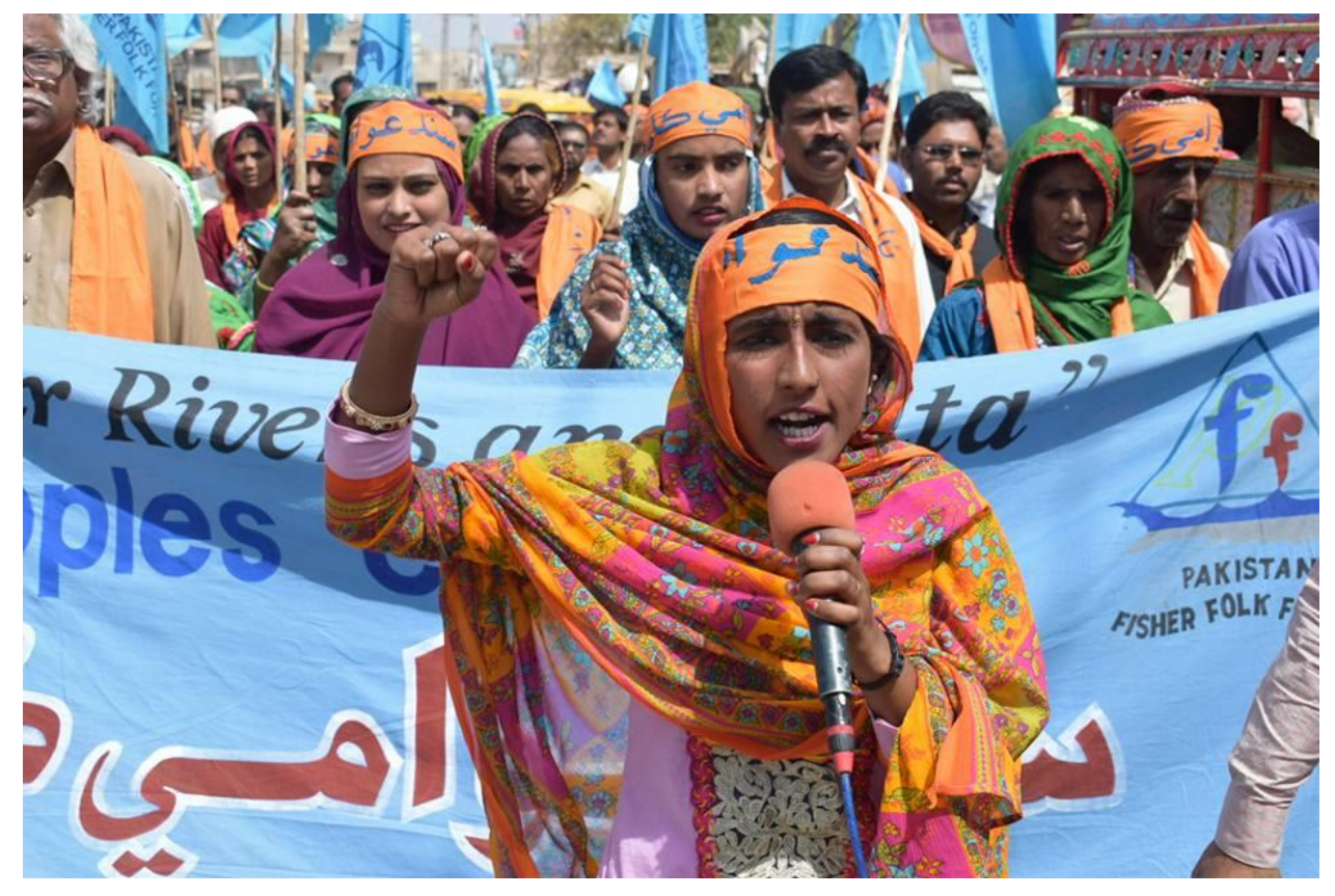
discussions were held during the gathering in the village.

Reception at Bhutto Village, Jamshoro: After launching a successful campaign in previous villages, Sindh Peoples Caravan arrived in Bhutto Village. Where the villagers cordially received all the participants of the Peoples Caravan. The speeches made there in the village depicted the power of the common people for carrying out revolutionary resistance against the State's intentions of destroying the Delta and the Indus River. Awareness raising participatory